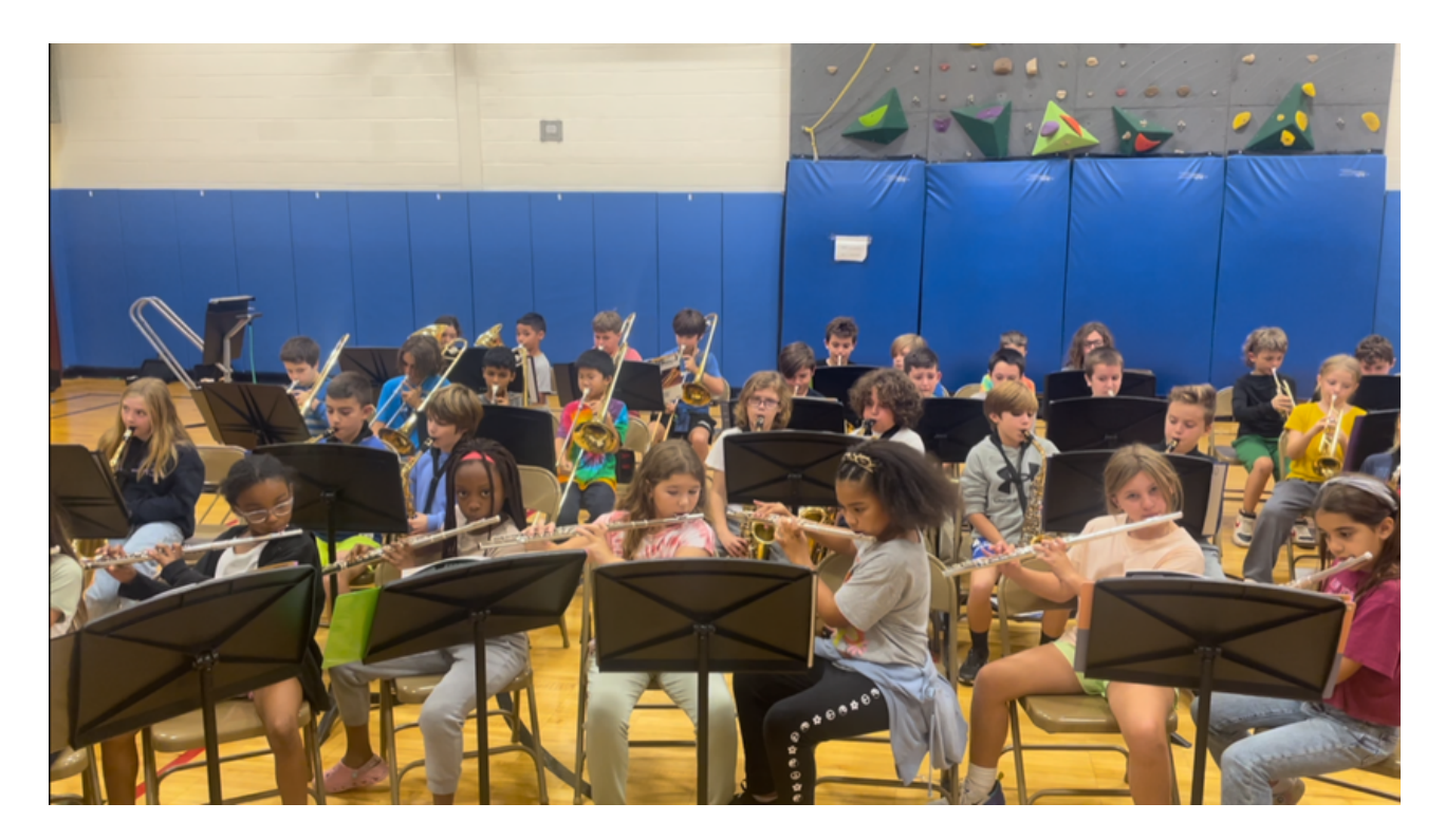
Griswold 4th Grade Beginning Band

The McGee Band performed at the Berlin Fair in September. It was an awesome event, and we are so proud of the students for working so hard to prepare for this performance at the start of the school year!